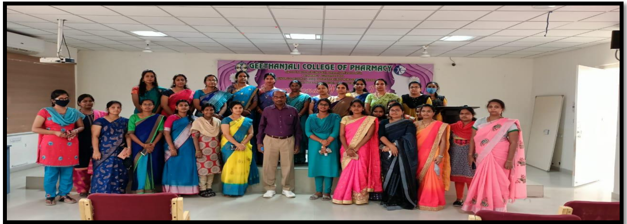
International Women's Day