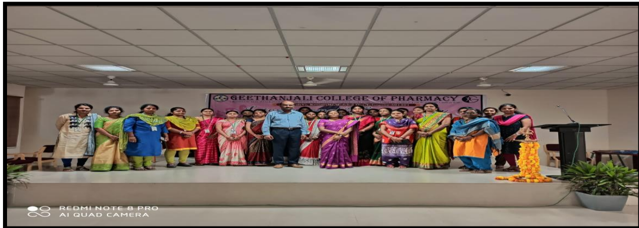
International Women's Day