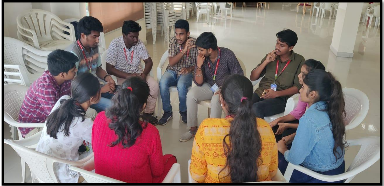
Debate-Women Empowerment is hollow if Gender Bias is still an issue