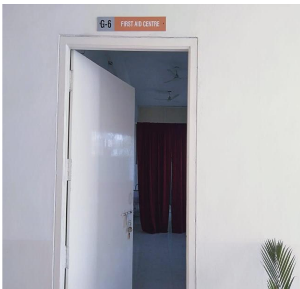
First aid center

In most of the departments, common rooms have been allocated for men and women, which also facilitate meetings and discussions.