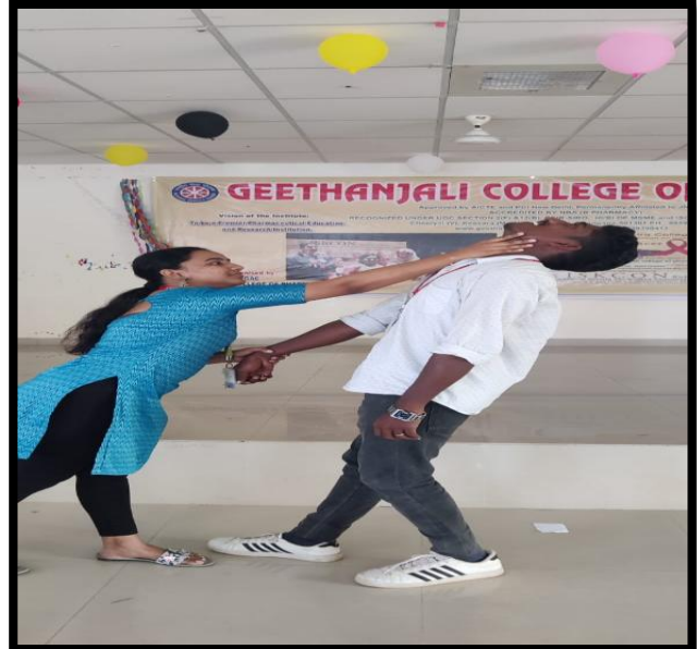
Awareness Programme – Self Defense