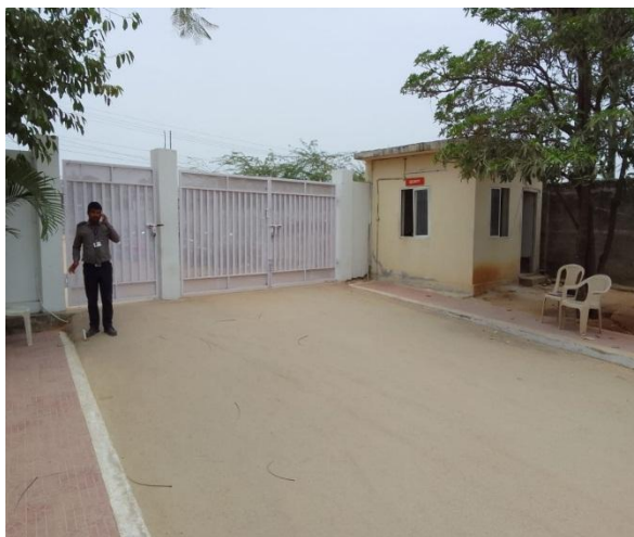
Security check points