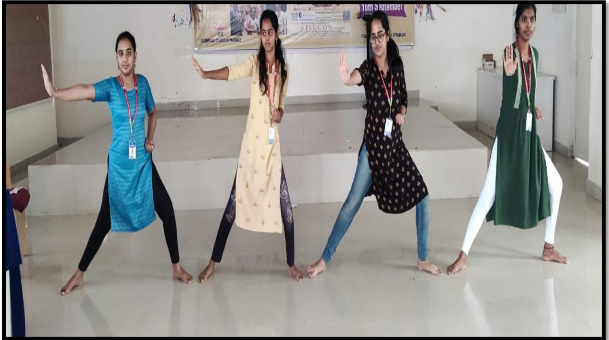
Awareness Programme – Self Protection Tools