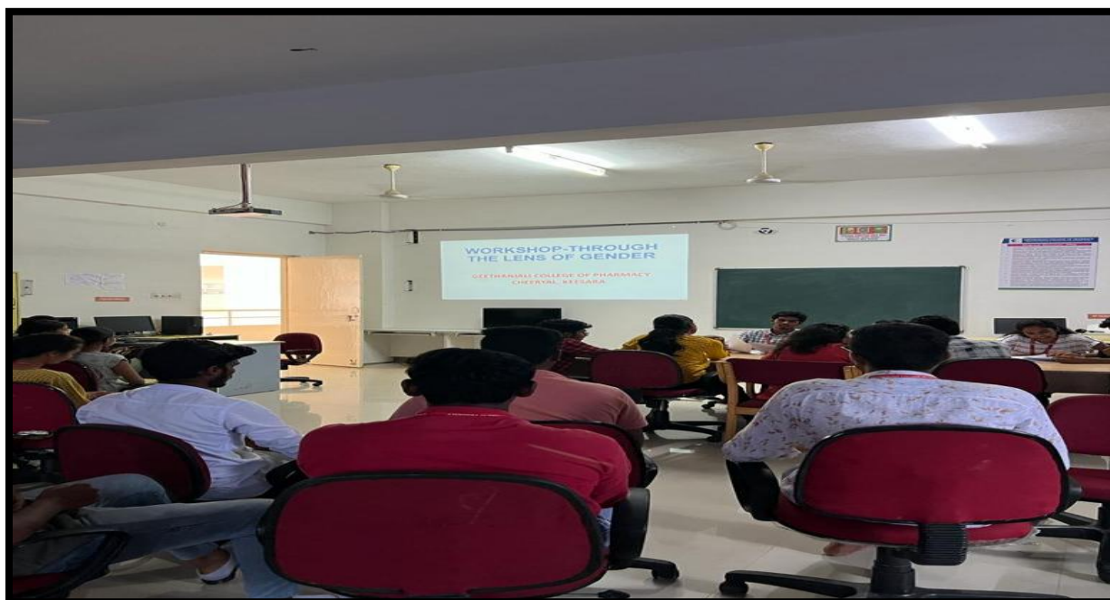
Workshop- Through the Lens of Gender (Gender Equalization)