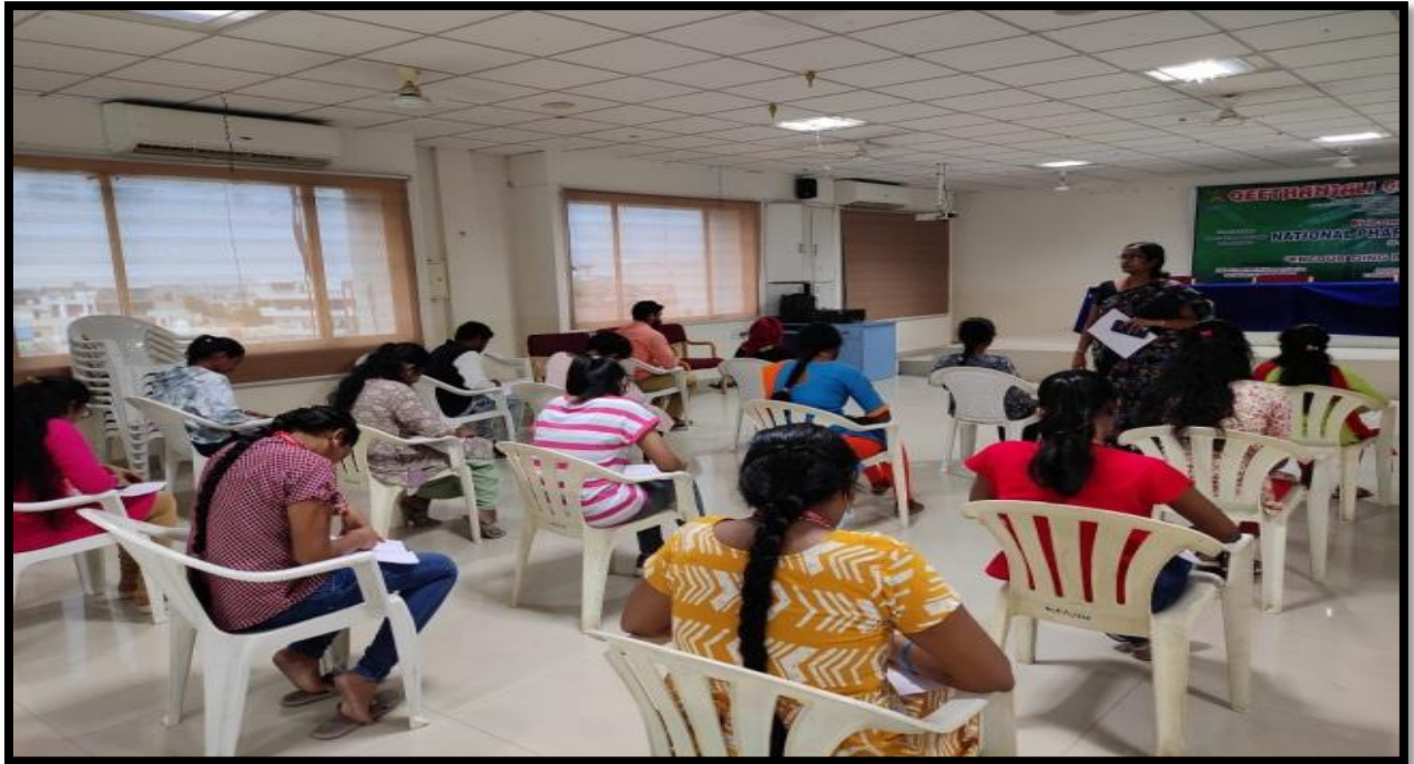
Elocution on women as victims of human trafficking (Or) Controversy of Gender and Race Discrimination