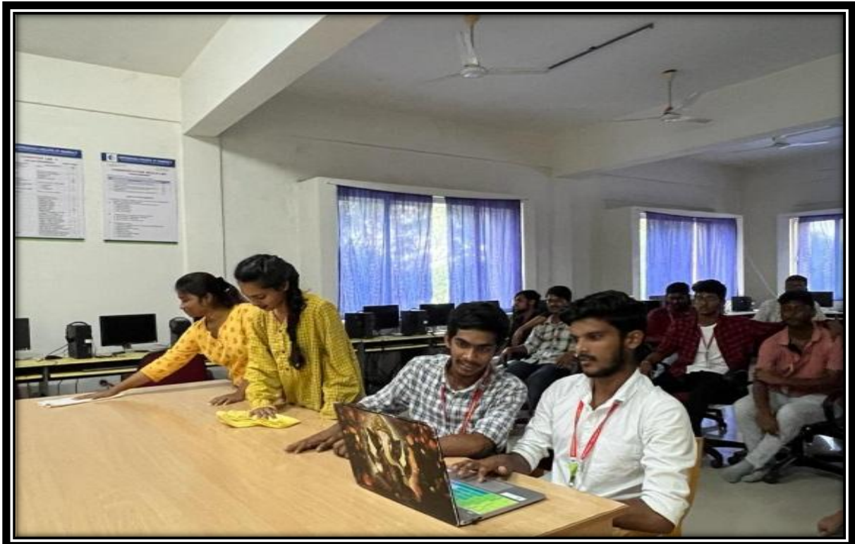
Workshop- Socialization: Making Women, Making Men