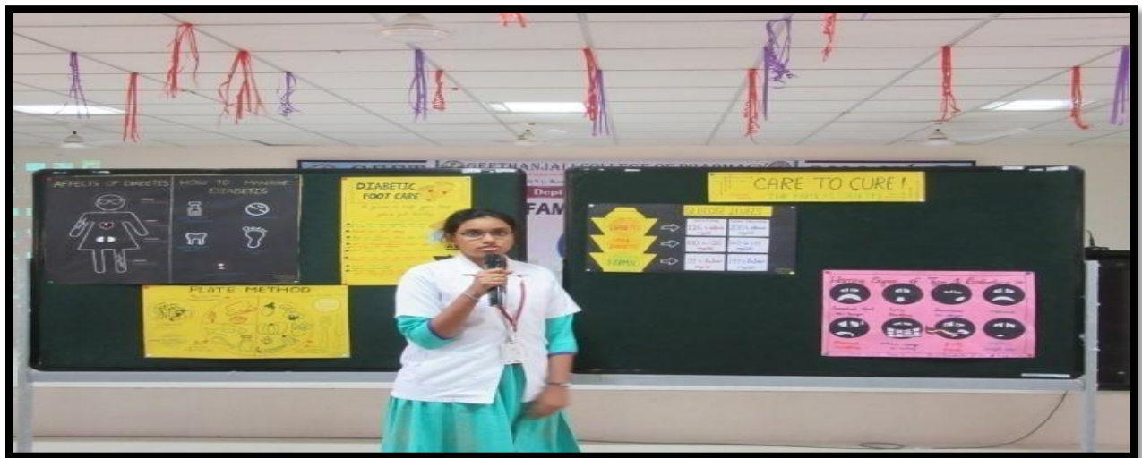
World Diabetic's Day