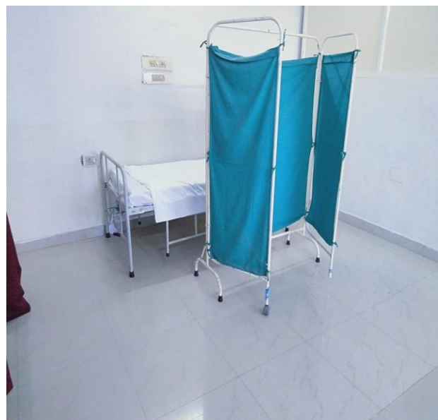
Restroom for female students