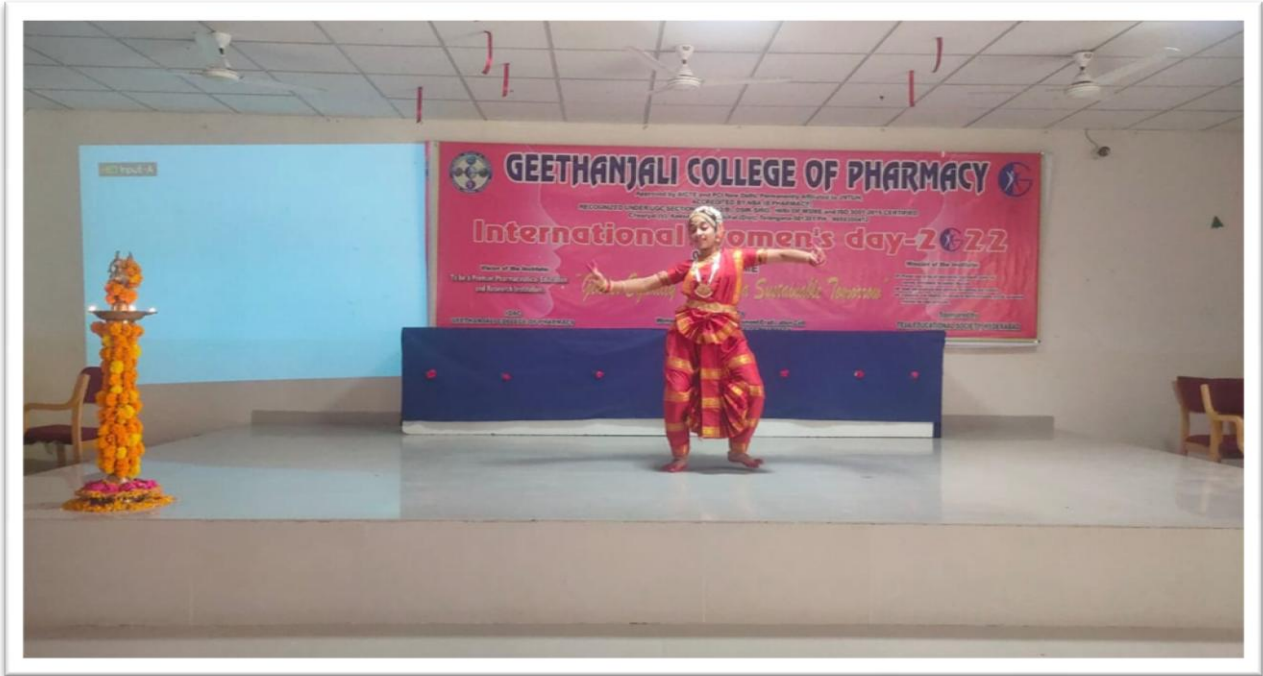
International Women's Day